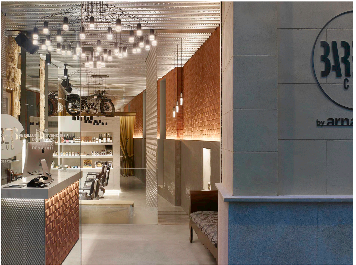
The Barber's Club. Designed by Minimal Studio.